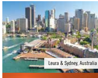
Leura & Sydney, Australia

Associate of Applied Science in Baking and Pastry (2 years)