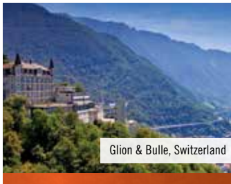
Glion & Bulle, Switzerland